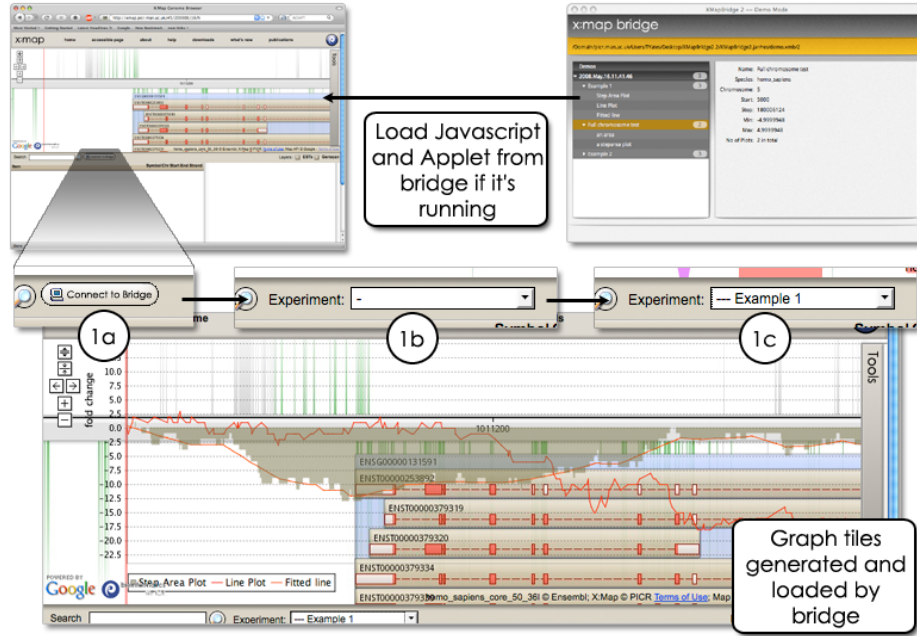
Figure 2: The process to show the graphs in the browser (1a) Click on the connect button (1b) This changes into a drop-down select box (1c) select the graph of choice

If this folder does not exist when the XMapBridge is first run, (and there is no environment variable set), then the application will run in demo mode, showing three demo graphs for you to see how it works on your system (figure 2).